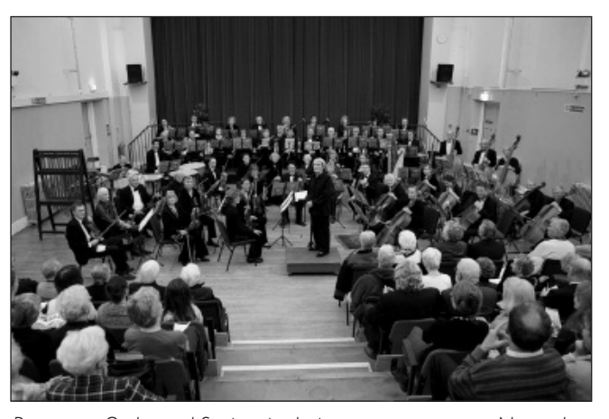
Penzance Orchestral Society in their centenary season, November 2006.